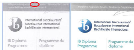
The word 'Course' indicates that the student on the left did not meet all requirements for the full IB Diploma

...the meaning of the word 'Course' on an IB transcript.